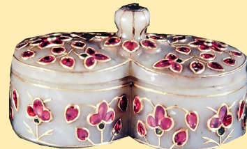
Precious Gem Studded Sindooran

In its diverse collection of Art ware various metal images, arm and armour, musical instrument, artefacts of