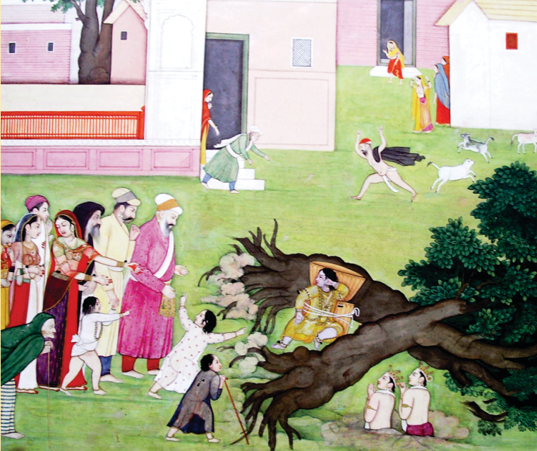
Deliverance of Yamla-Arjun, Kangra School

Among the archaeological collection prehistoric tools, fossils, beads, seals, copper age implements, terracotta artefacts, estampages, inscription, various types of potteries, Brahmanical, Jaina and Buddhist sculptures and bricks recovered during archaeological excavations are preserved in the collection.