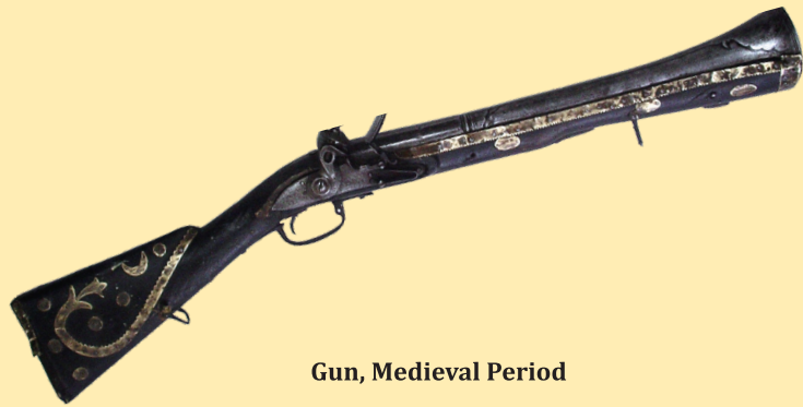
Gun, Medieval Period

Among stone sculptures human size headless Bodhisattva, app 1 st Cent. B.C.E. Mathura, inscribed image of Buddha, app 5 th Cent. C.E., Mankunvar Buddha app 5 th C.E., Prayagraj inscribed Jain Sarasvati, 1 st Cent. C.E., Kankali mount, Mathura; Viratroop Vishnu, 5 th Cent. C.E., Garhwa, Prayagraj, Surya app 12 th Cent. C.E., Mathura are few to mention.